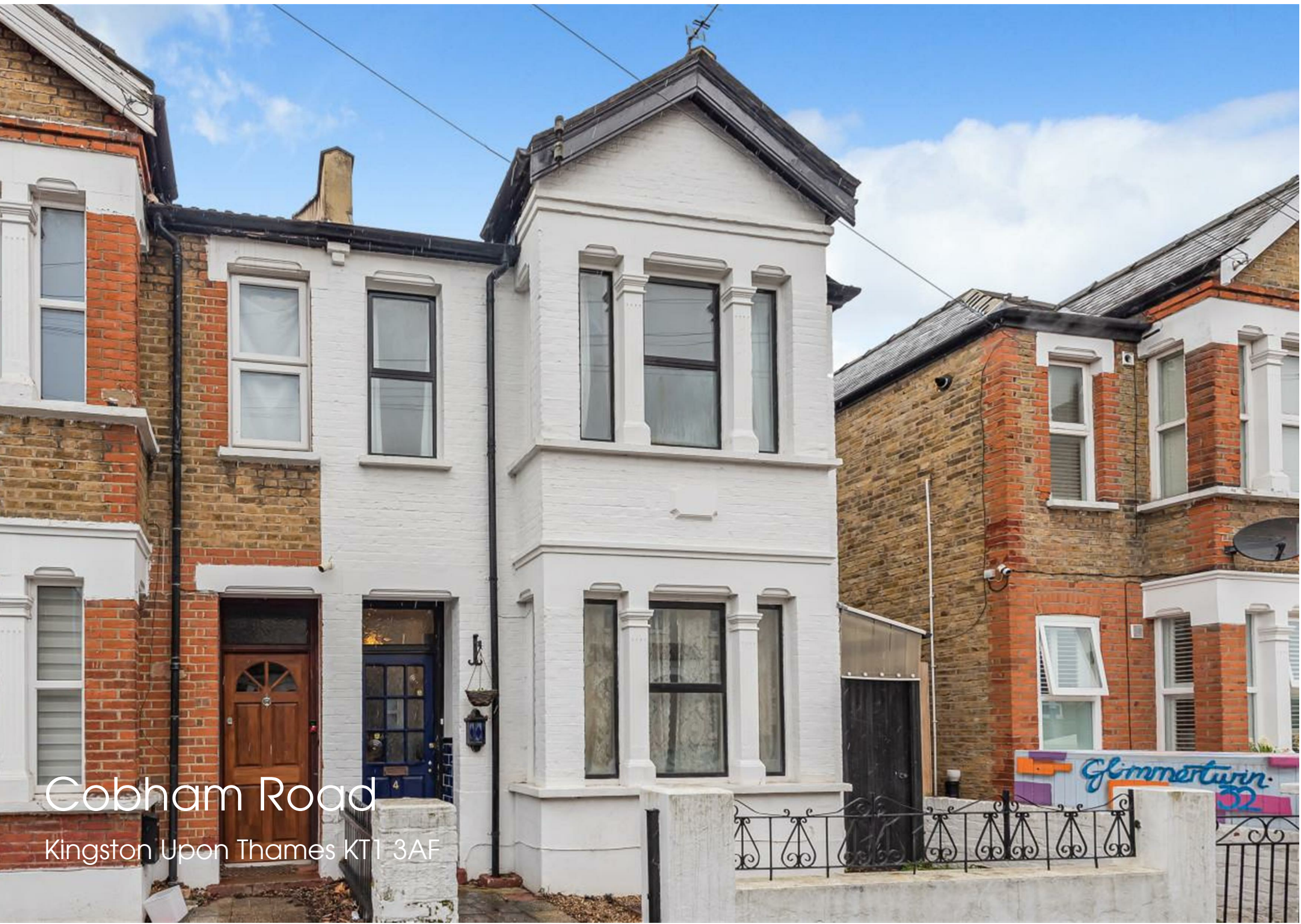
Cobham Road Kingston Upon Thames KT1 3AF